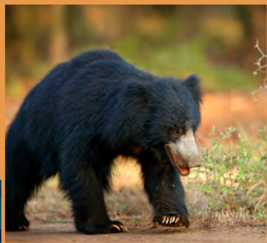
Classic Escapes protects our planet. ♻️

Download a full itinerary and reservation form at https://www.classicescapes.com/wp-content/uploads/2021/03/2022WACIndia.pdf