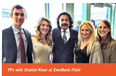
YPs with Shahid Khan at EverBank Field