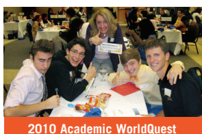
2010 Academic WorldQuest

The Council needs your support to make our seventh annual Academic WorldQuest competition as successful as previous years! Our 2011 competition will be held Tuesday, November 15 from 5:30-9:00 p.m. at the UNF University Center. Academic WorldQuest is a fun, fast-paced competition where high-school teams test their collective knowledge of international facts. The contest consists of six rounds of multiple choice questions.