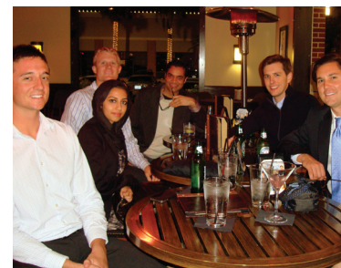
YPs at monthly Stammtisch