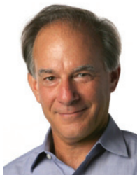
David Ignatius National Defense Analyst and Washington Post Columnist

Tuesday, January 10, 2012 7:00-8:30 p.m. University of North Florida, University Center