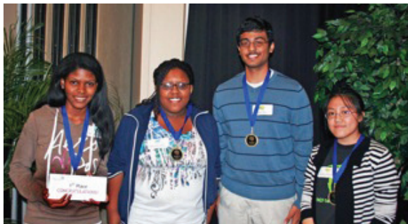
Stanton's WorldQuest 2011 Team XAOC