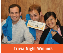
Trivia Night Winners

Off to a fresh start and new venue at Hightide Burrito Co. , the Young Professionals gathered on June 13 to revive their fun and competitive YP Trivia Nights . Throughout the evening, team spirit developed quickly and competitors were