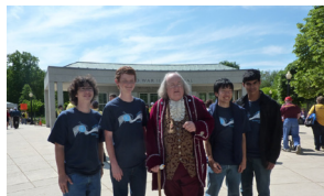
Stanton Students with Ben Franklin